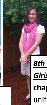
8th Grade Girls Only - chapel uniform with dressy scarf - (any color)