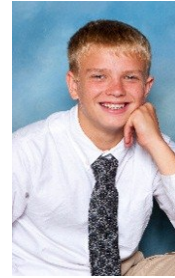
Tie optional instead of vest for all 6-8 boys chapel uniform