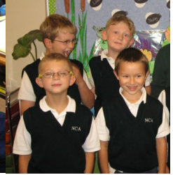
Boys chapel uniform examples. (Elementary boys wear navy pants.)