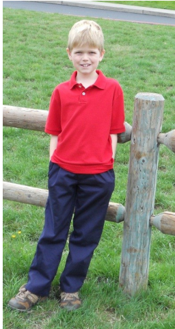
Everyday wear examples.