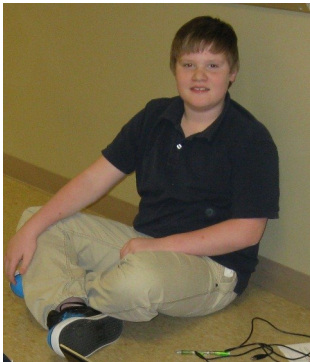
Everyday wear examples